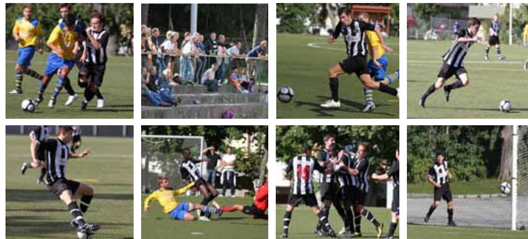
Recent photos